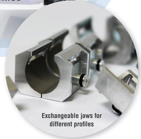
Exchangeable jaws for different profiles