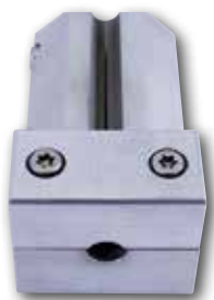
Profile adapter for round belts