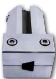
Profile adapter for V-belts