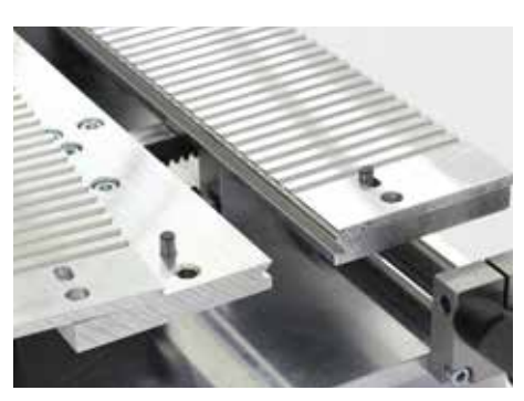
Locking pins ensure the correct positioning of the adapter plates on the joining table.