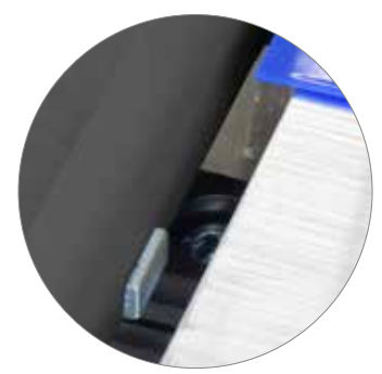
Insert bar for repeatable welds