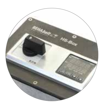
Robust and easy to use control unit for temperature control