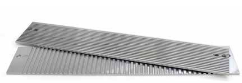
For optimum alignment and clamping of the belts to be welded in the joining table, optional adapter plates for more complex structures are available (not included in the standard product range).