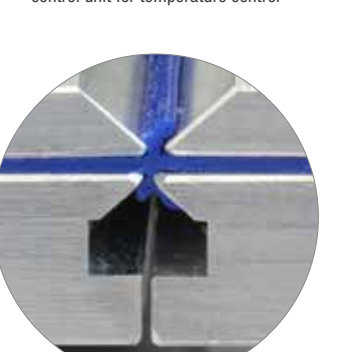
Clamping bars with chamfer for optimum shaping of the welding bead