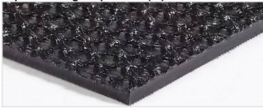
Top side: Rough impression (RI)