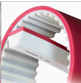
PU coatings for toothed and V-belts