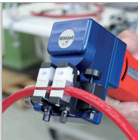
Welding/joining technology for PU and TPE