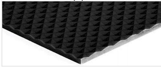
Bottom side: Diamond (ID)