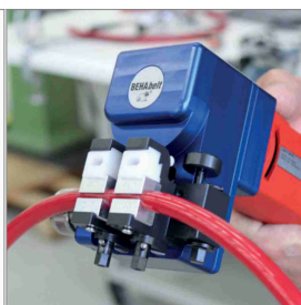
Welding/joining technology for PU and TPE