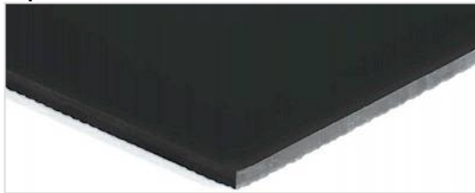
Top side: Smooth matt (SM)