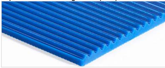
Top side: Transversal grooves (TGA)