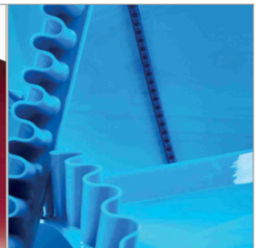
Belt accessories made of PU