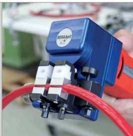
Welding/joining technology for PU and TPE