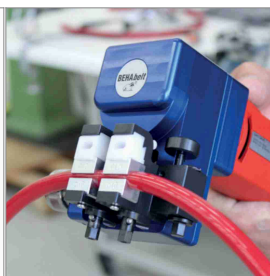
Welding/joining technology for PU and TPE