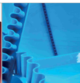
Belt accessories made of PU