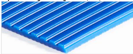
Top side: Longitudinal grooves (LGB)