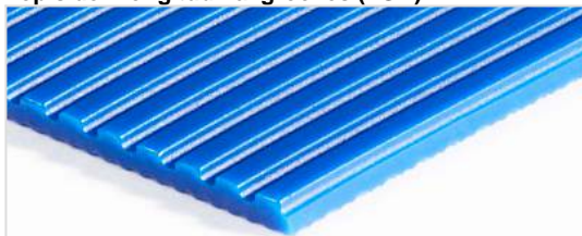
Top side: Longitudinal grooves (LGB)