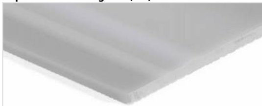
Top side: Smooth gloss (SG)