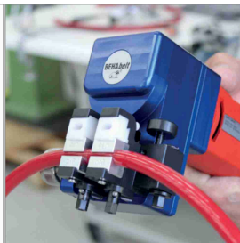
Welding/joining technology for PU and TPE