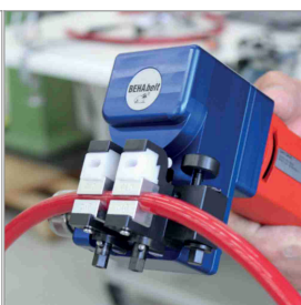
Welding/joining technology for PU and TPE