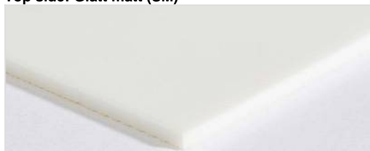
Top side: Glatt matt (SM)