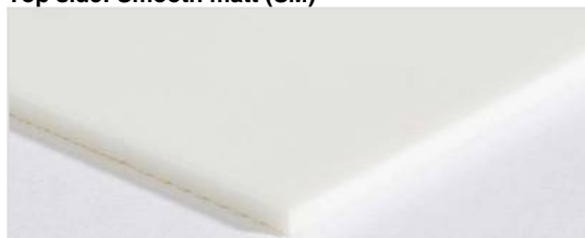
Top side: Smooth matt (SM)