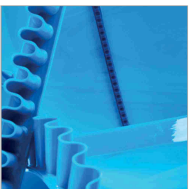
Belt accessories made of PU