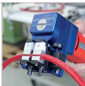
Welding/joining technology for PU and TPE