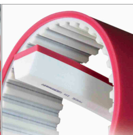
PU coatings for toothed and V-belts