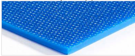
Bottom side: Fabric impression (FI)