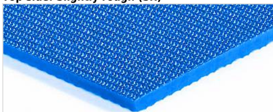
Top side: Slightly rough (SR)