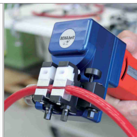
Welding/joining technology for PU and TPE