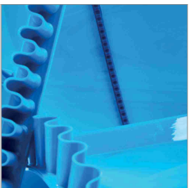
Belt accessories made of PU