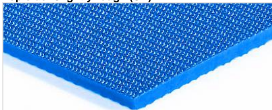
Top side: Slightly rough (SR)