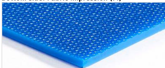
Bottom side: Fabric impression (FI)