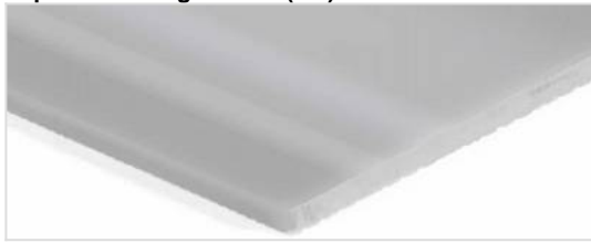
Top side: Glatt glänzend (SG)