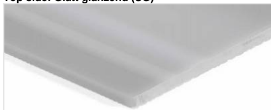
Top side: Glatt glänzend (SG)