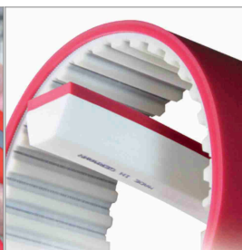
PU coatings for toothed and V-belts