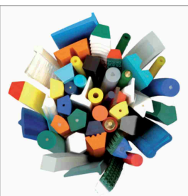
Weldable belts made of PU and TPE