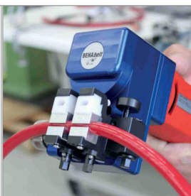
Welding/joining technology for PU and TPE