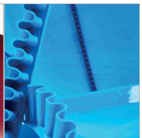
Belt accessories made of PU