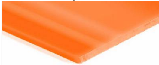
Bottom side: Smooth gloss (SG)