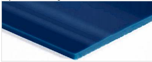
Top side: Smooth gloss (SG)