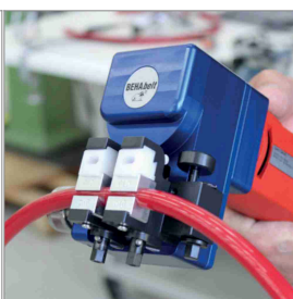
Welding/joining technology for PU and TPE