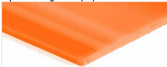
Top side: Glatt glänzend (SG)