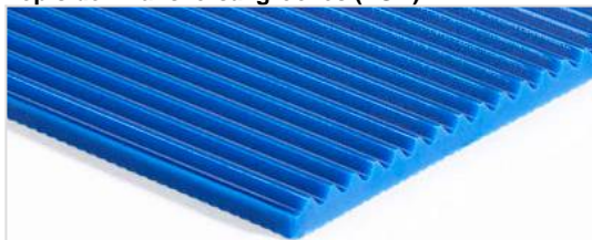
Top side: Transversal grooves (TGA)