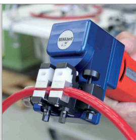
Welding/joining technology for PU and TPE