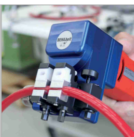
Welding/joining technology for PU and TPE