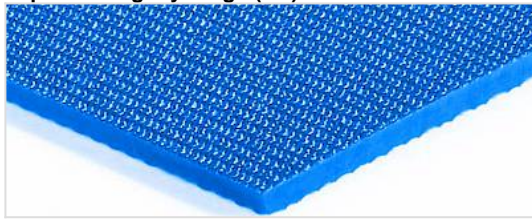
Top side: Slightly rough (SR)