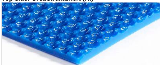
Top side: Grobstrukturiert (RI)