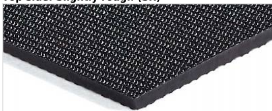
Top side: Slightly rough (SR)